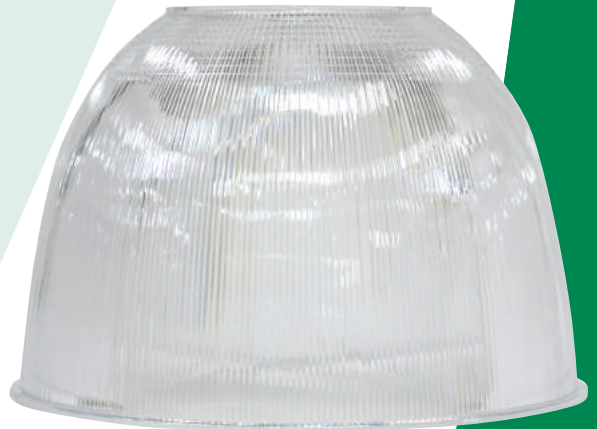
Reflector GHBPC70D 70° Beam