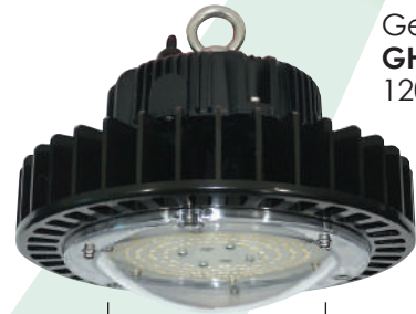
Gear Only GHB150W 120° Beam

Warehouses, Factories, Sports Halls, Workshops, Storage Centres, Industrial Facilities, Public Infrastructure, Institutions